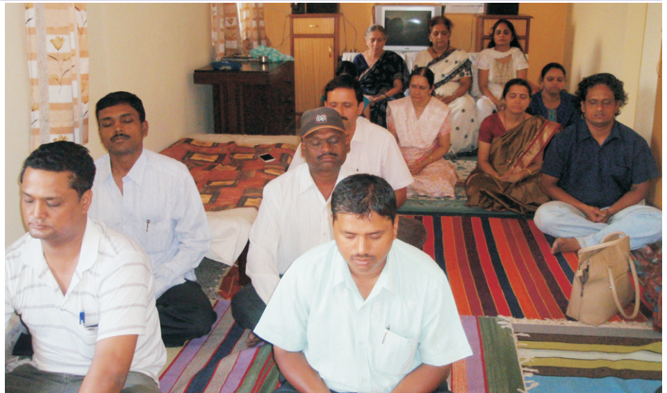
A Light Channelling Session underway in a Regular Light Channelling Centre in Pune