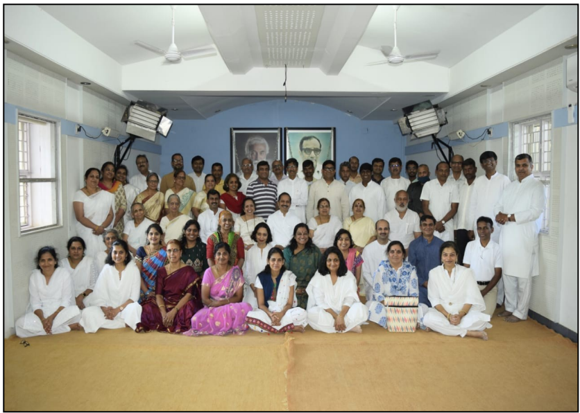
A guided Light Channelling session conducted in Manasa Foundation, Taponagara, Bangalore and was webcast live on April 18, 2021

We conduct guided Light Channelling sessions on the third Sunday of every month from 11 am to 11.30 am and will be webcast live on www.lightagemasters.com/lc_live . We request you all to participate in these sessions.