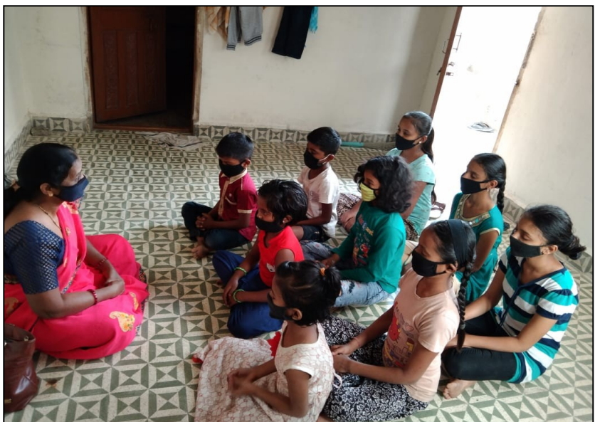
Students of Pratham Foundation, Pune channelled Light on February 1, 2021